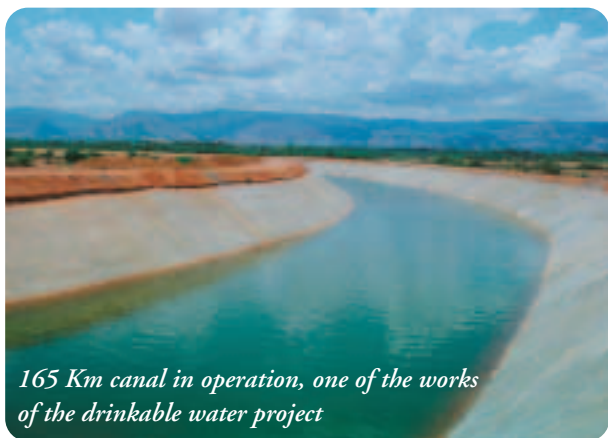
165 Km canal in operation, one of the works of the drinkable water project

Sai Baba has never asked for money for any of these works. He gives those who are willing, the possibility to contribute for the benefit of all.