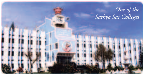
One of the Sathya Sai Colleges

Abandon your ego and all problems will disappear.”