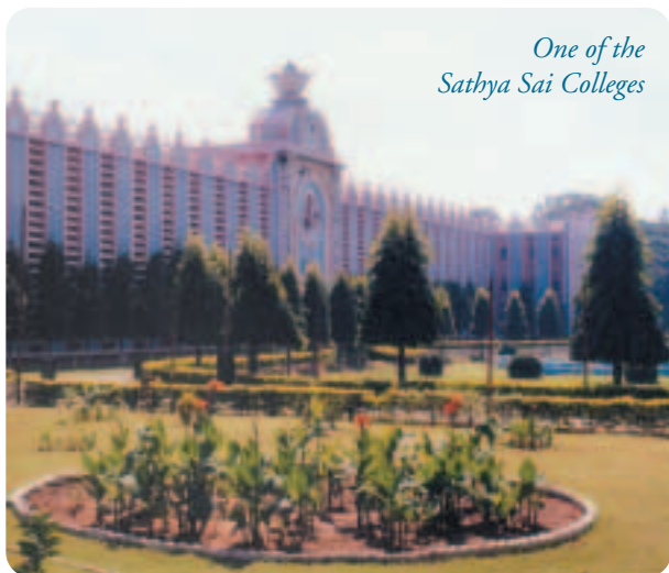
One of the Sathya Sai Colleges

The graduates from Sai Baba's universities are sought after all over the world. Besides scholastic excellence, their integrity represents a guarantee of honesty and professional expertise.